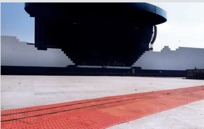
The RedFloor system allows, in combination with appropriate special elements, particularly shallow junctions