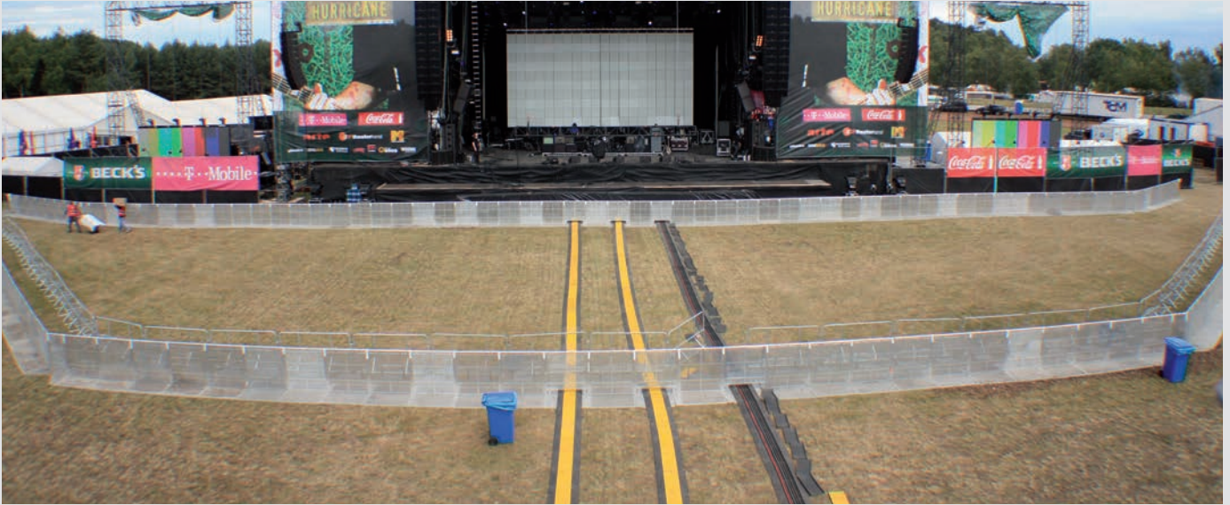
Cable protectors, Hurricane Festival, Scheessel, Germany