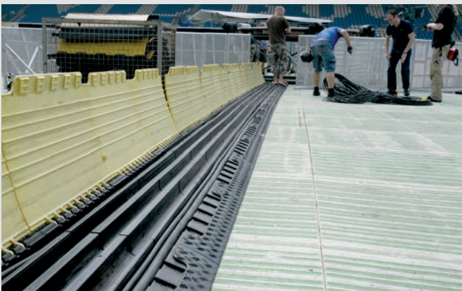
An inside view of a multi-channel cable run during installation