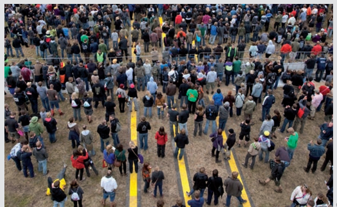
Securing cable runs through the audience