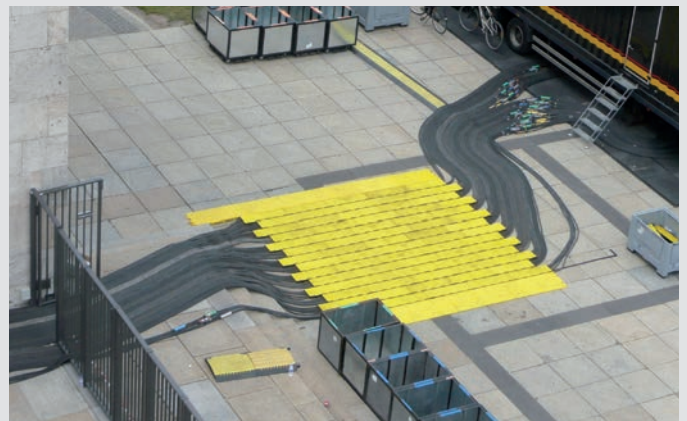
The expandable Yellow Jacket AMS System