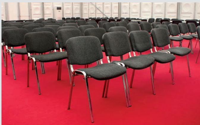
A press tent furnished with Object chairs