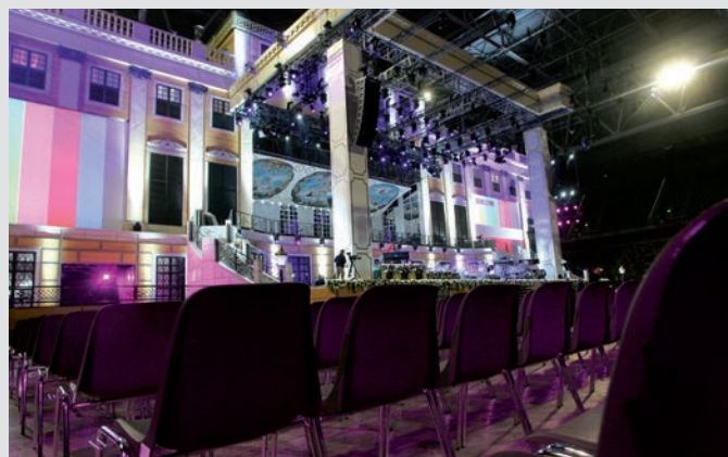
Shell chairs, André Rieu concert, Esprit Arena, Dusseldorf, Germany