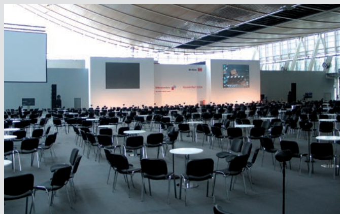
Object chairs assembled for a corporate event