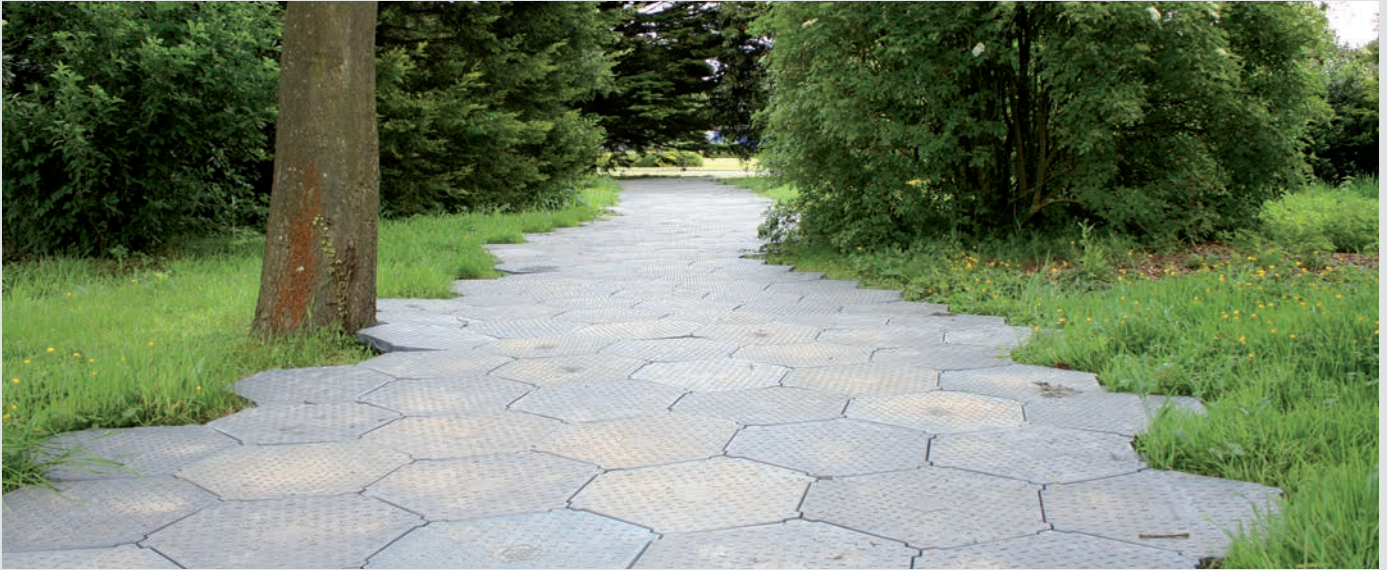
A Hexagon tile footpath