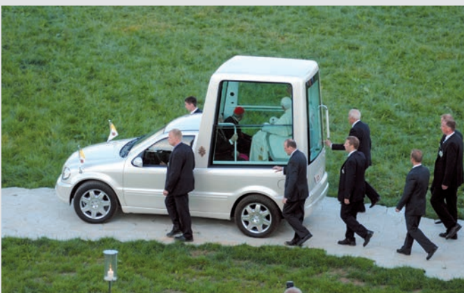
The Popemobile on a temporary Hexagon road, World Youth Day 2005, Cologne, Germany