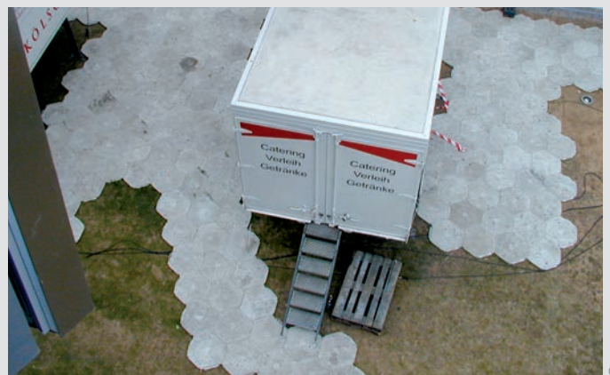
Hexagon tiles surrounding a catering trailer – just one example of the flexible installation options