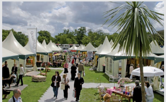
A Hexagon walkway at a Home and Garden exhibition