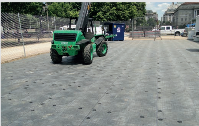
Protection of a construction site in grey