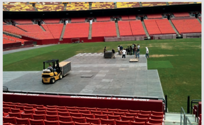
Matrax as transport road and storage area in stadiums