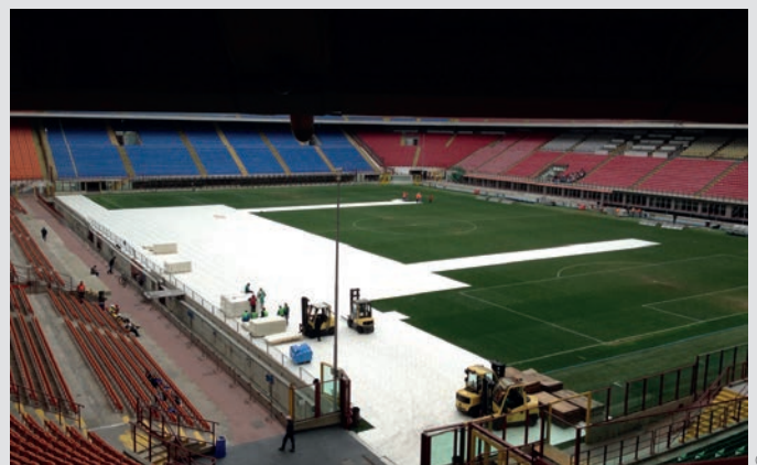
As turf protection for an event in white