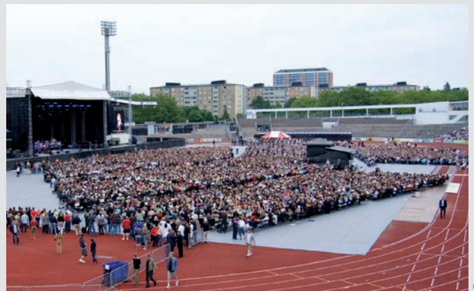
Elton John concert, Malmo Stadium, Sweden