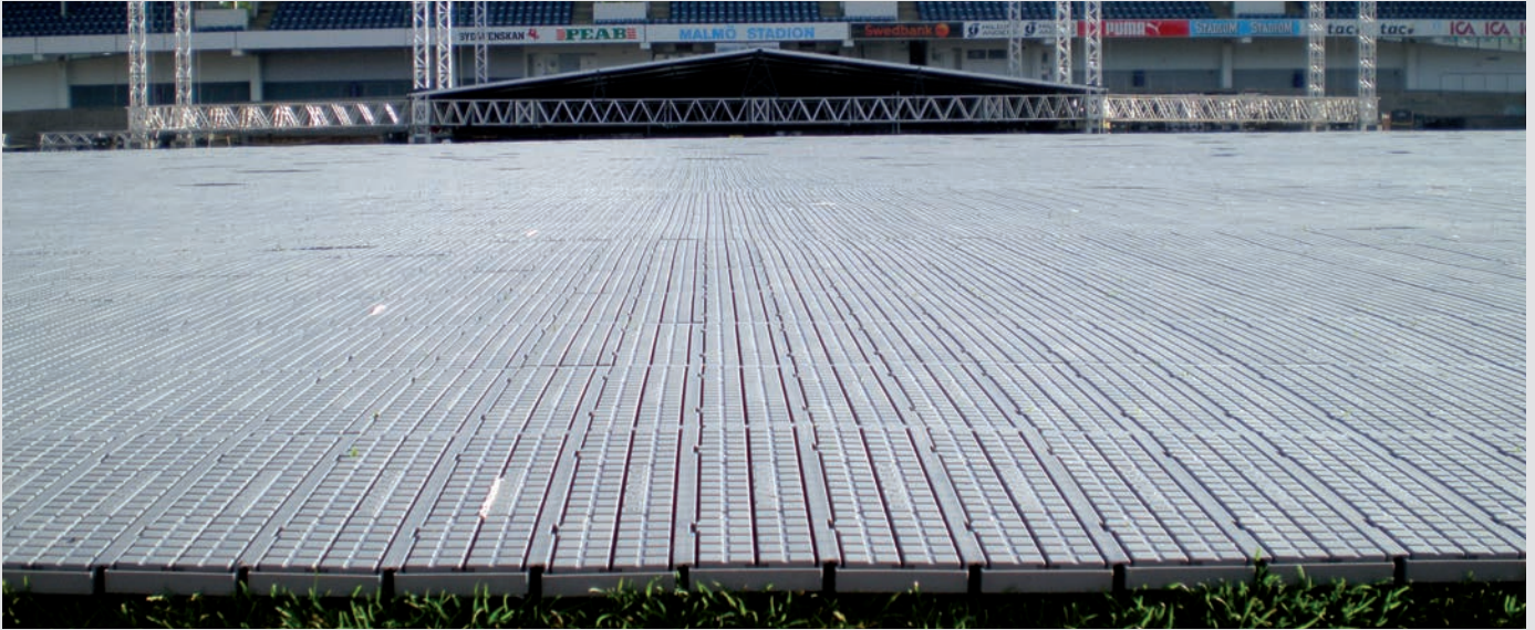
Portafloor turf protection up close