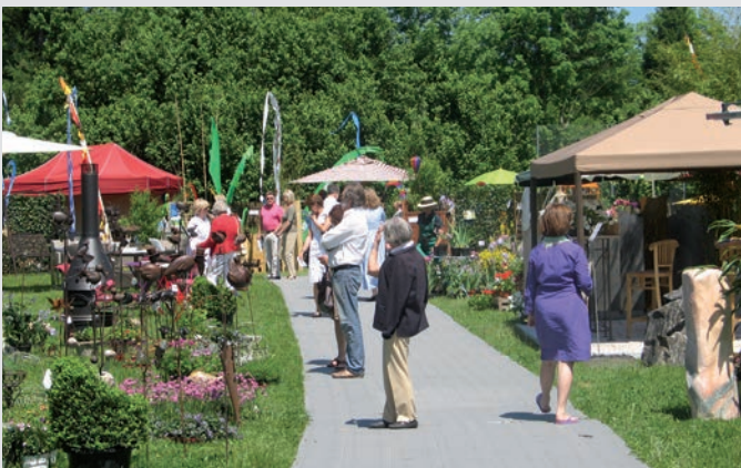
A Portafloor walkway at a Home and Garden exhibition