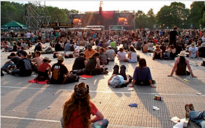
Sundown at Rock im Park, Nuremberg, Germany