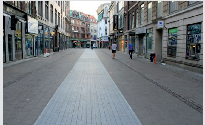
Copenhagen Fashion Week, 1.6 km catwalk through the city center