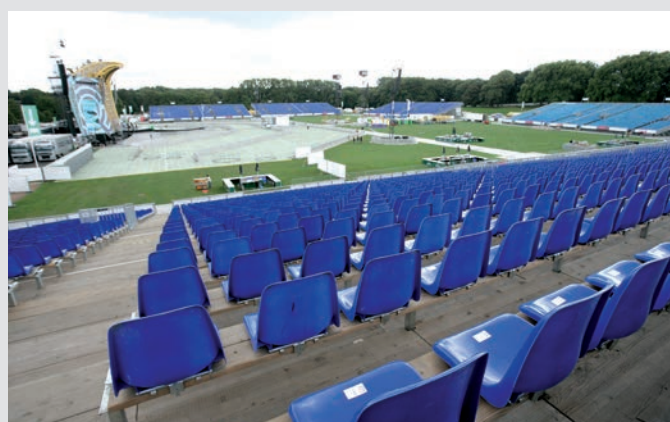
eps grandstands for a Robbie Williams show, Open Air Arena, Cologne, Germany