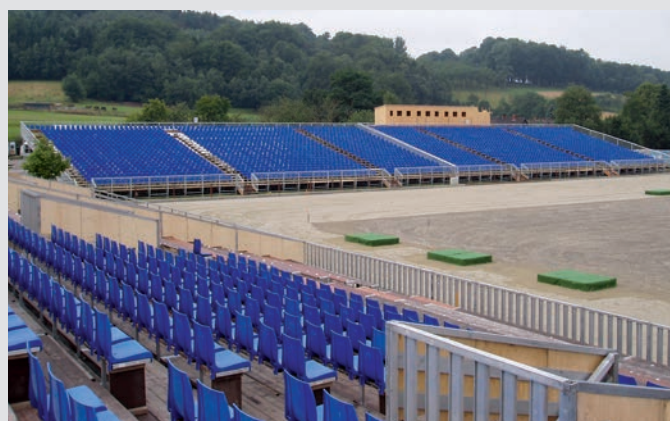
Grandstands for the European Dressage Championships, Hagen, Germany