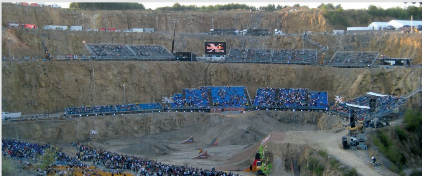
Grandstands built into a hillside for a motocross event