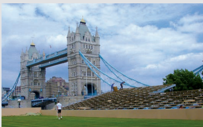
eps grandstands, Wimbledon at Tower Bridge, London, England